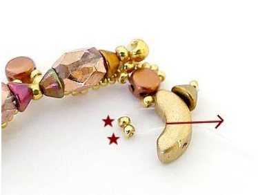
19) Pick up 2 R15, pass through central hole of Arcos. Repeat steps 17 to 19 (for 3 holes of Arcos)