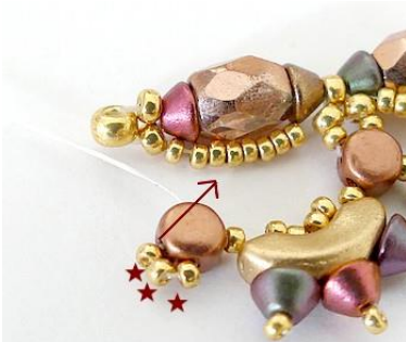
22) Pick up 3 R15, pass through 2nd hole of Kalos