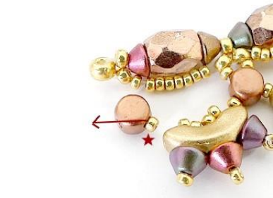
21) At the end of the bracelet, pick up 1 R15, 1 Kalos