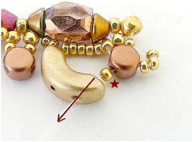
16) Pick up 1 R15, 1 Arcos