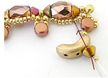
18) Pass through same Konos and Arcos