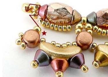
23) Pick up 1 R11 and pass through 2 R11 and R8 like picture