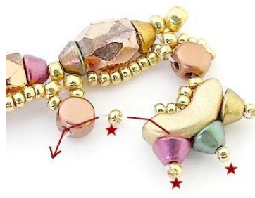
20) Pick up 1 R15, pass through 2nd hole of Kalos, repeat steps 16 to 20 for the length of the pattern