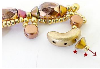
17) Pick up 1 Konos, 1 R15