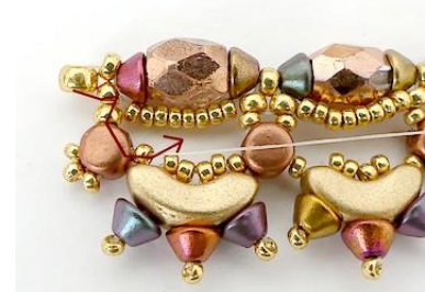
24) Pass through 2R11, Kalos and R15